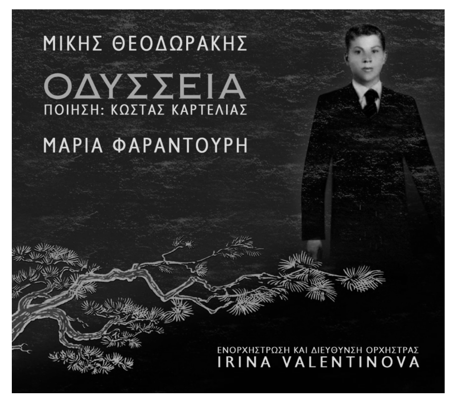
Figure 1. The cover of the Odyssey , Legend Recordings 2007. Photograph of Mikis Theodorakis at the age of twelve in 1937.

time when he lived in Patras with his family (Figure 1).<sup>4</sup> In his autobiography Theodorakis described his two-year stay in the Achaean capital (1937–38) as 'carefree years'<sup>5</sup> and states that the main event of that period, which determined his later course, was his enrolment in the Odeion of Patras and his decision to involve himself in music.<sup>6</sup> The publication of the childhood photograph becomes an important element adding to the autobiographical significance of the Odyssey , as a means of mythologizing the personal history of the composer. Theodor