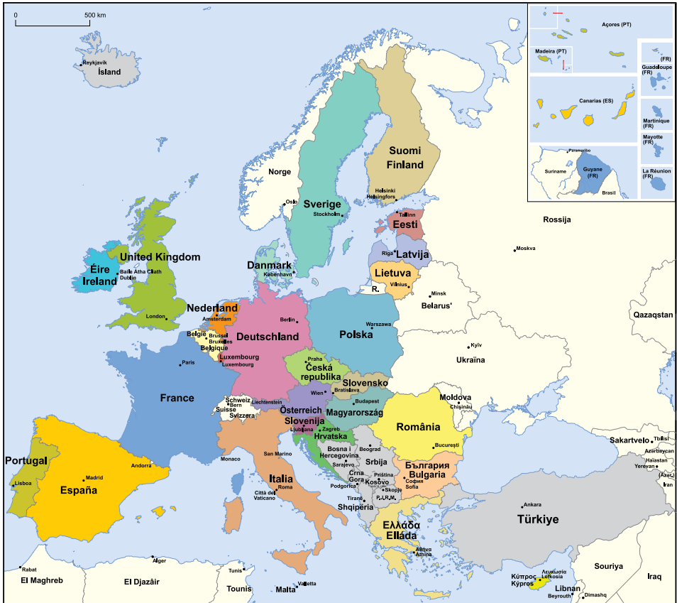
Member States of the European Union (2013) Candidate countries and potential candidates