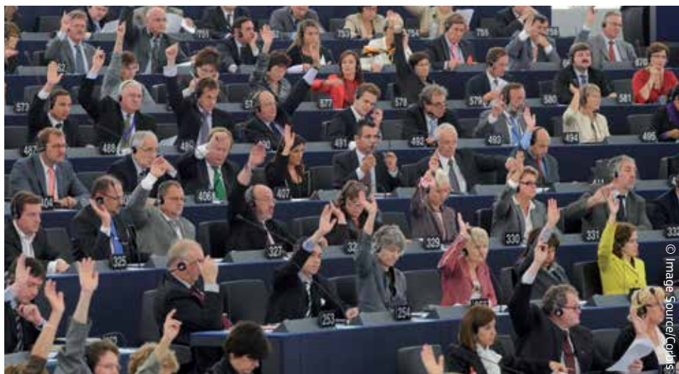
The European Parliament — this is where you can make your voice heard.

In 2011, a German, Martin Schultz (Progressive Alliance of Socialists and Democrats), was elected President of the Parliament.