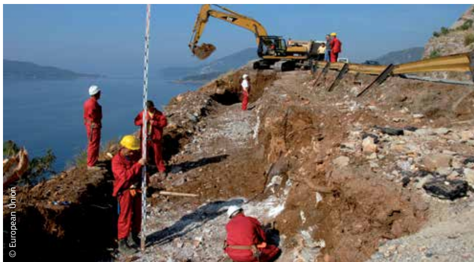
The EU gives financial aid to help build the economy in neighbouring countries.

The EU's financial assistance to both groups of countries is managed by the European Neighbourhood and Partnership Instrument (ENPI).