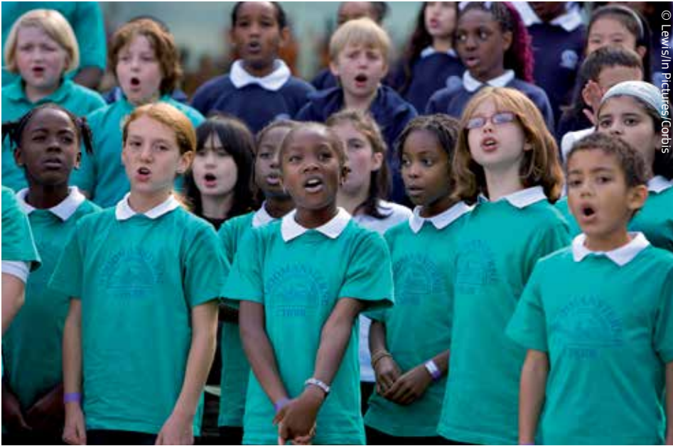
United in diversity: working together achieves better results.

In today's world, rising economies such as China, India and Brazil are set to join the United States as global superpowers. It is therefore more vital than ever for the Member States of the European Union to come together and achieve a 'critical mass', thus maintaining their influence on the world stage.