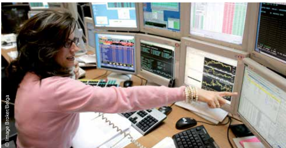
New EU rules on economic and financial governance have helped to clean up and strengthen the banking sector.

The European Union also takes action to protect consumers from false and misleading advertising, defective products and abuses in areas such as consumer credit and mail-order or Internet selling.