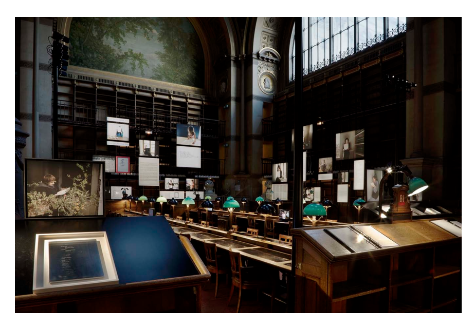
Figure 3. View of the exhibition Sophie Calle, Prenez soin de vous , Bibliothèque Nationale de France, Site Richelieu, Paris, 2008.

glides as she performs her astonishing soprano lament. We think too of the miniature proscenium stage of the guignol whose plush red curtains sweep across to punctuate, and then bring an end to, the 'stock' melodrama-cum-comedy action (Guignol writing a letter in Act 1; Madelon receiving it, then fainting, in Act 2). Performance also takes place in everyday spaces with the result that a range of performance arenas are juxtaposed and the idea of performance seeps into every facet of life. Performance, in short, is seen to be omnipresent. What, though, of the performance spaces which house Calle's installation?