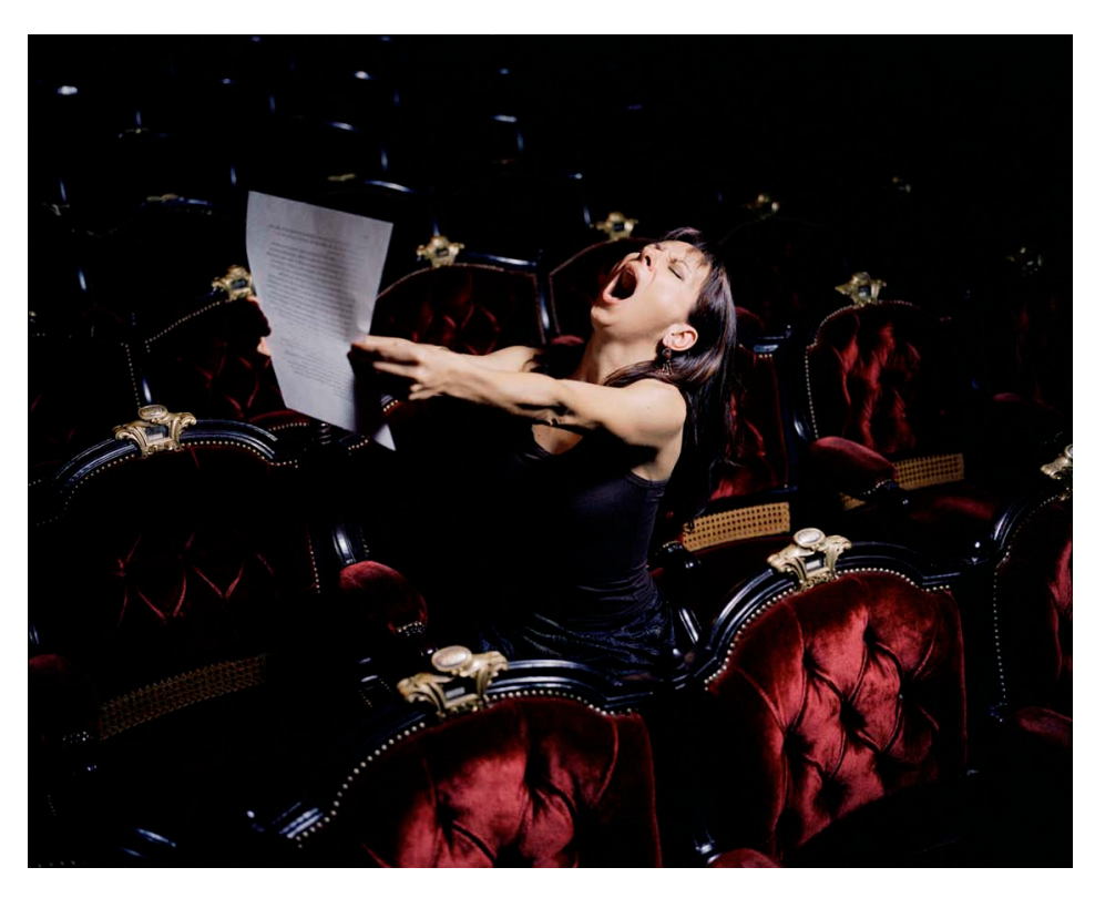
Figure 2. Performing the letter. Sophie Calle, Prenez soin de vous . Artiste lyrique, Nathalie Dessay. ©ADAGP, Paris and DACS, London 2013.