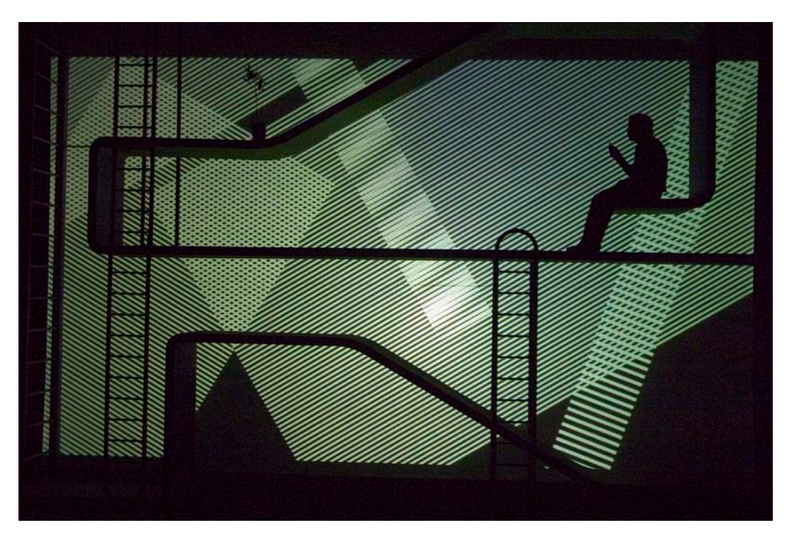
Breath , 2005, based on Samuel Beckett's play. Video installation by Nikos Navridis, as presented at the Istanbul Modern.