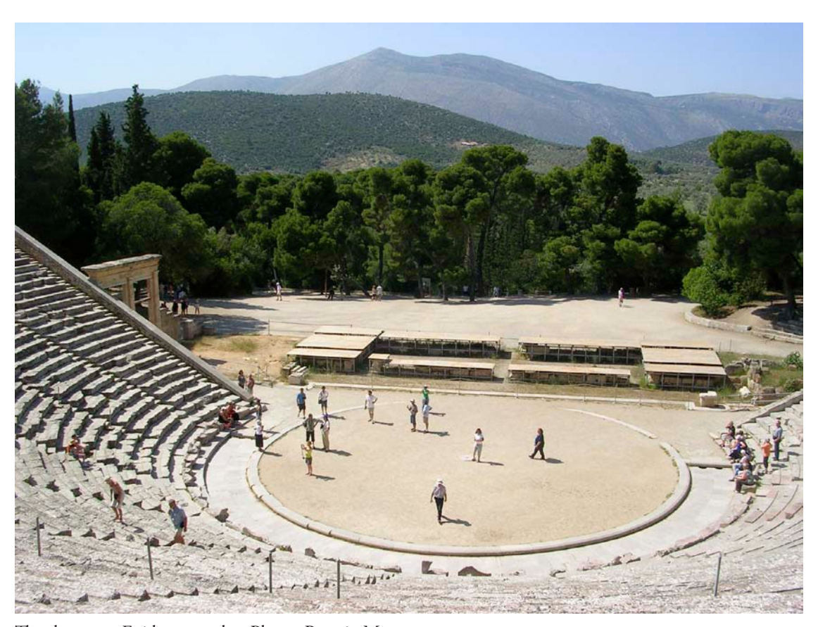
The theatre at Epidaurus today.