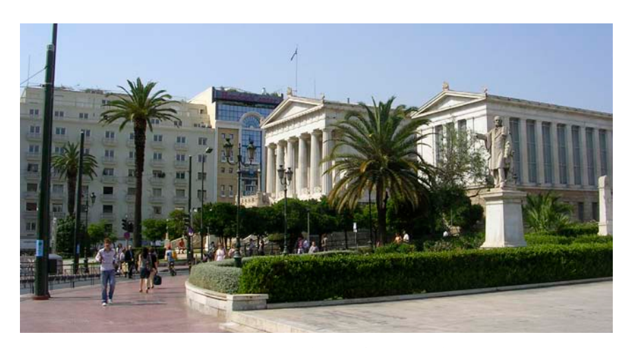
Constitution Square in the heart of Athens.