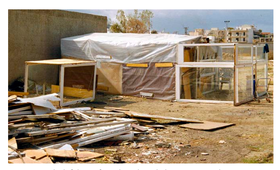
A makeshift house from the Avliza Vlach-Romanian settlement in Attica. Untitled , 2000, included in T.A.M.A. (Temporary Autonomous Museum for All) by Maria Papadimitriou.