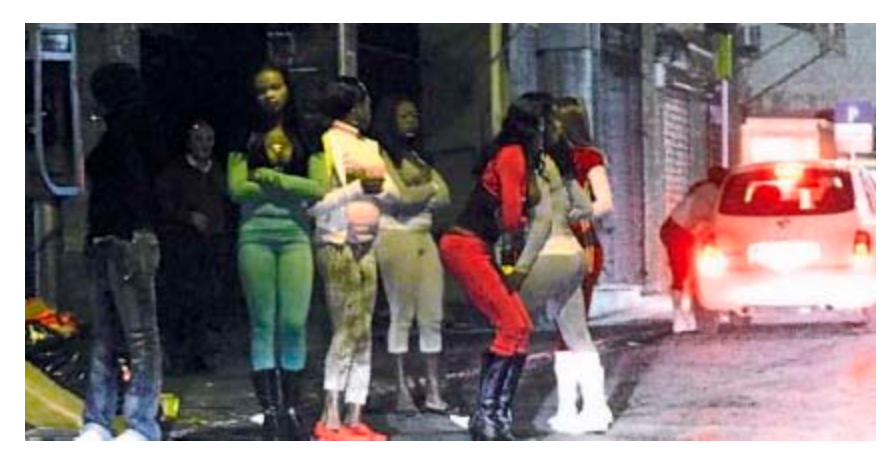
Prostitutes in the area of Plateia Theatrou (Theater Square) at Psiri in Athens.