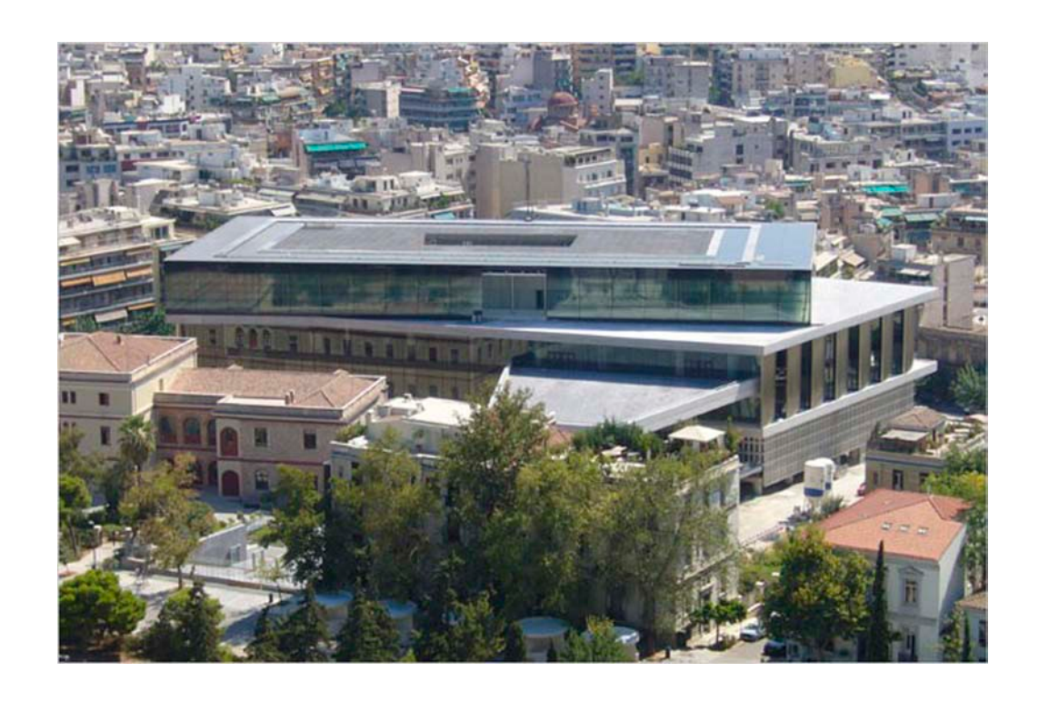
Top: Acropolis Museum, designed by Bernard Tschumi. Bottom: A car set on fire in the riots of early December 2008 in Athens; in the background is the University of Athens on Panepistimiou Street.