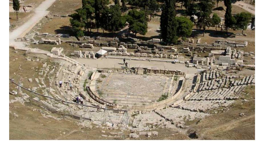
Contemporary view of the theatre of Dionysus in Athens.