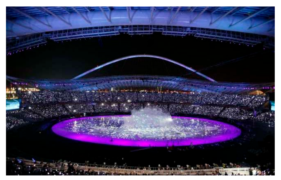
Opening ceremony of the Athens Olympics of 2004 in the stadium designed by Santiago Calatrava.