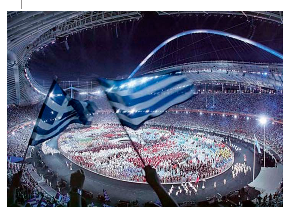
Opening Ceremony of the Athens Olympics of 2004 in the stadium designed by Santiago Calatrava.